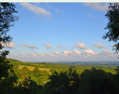
Weald view point 3-4

Start (Hosey Common car park) to point 2 (1.2km) Walk south for 20 minutes or so from the car park through mixed woodland following the signs for Chartwell. The woodland is being revived by Kent Wildlife Trust so is a bit scarred where invasive species are being stripped. On the left, close to the start, is Westerham Mines... old ragstone mines that are home to many bats. Just follow the waymarkers to Chartwell... you can't get lost although there is the odd path off to the left you should ignore.