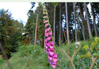
Giant foxglove, Tower Hill near point 9

Click here for GPX track (press icon bottom right for location – could be flaky though)